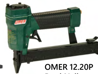
OMER 12.20P Brad Nailer (Max length 3/4")