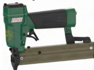
OMER 12P.25 Brad Nailer