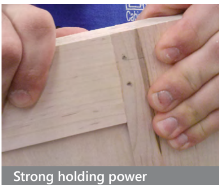
Strong holding power