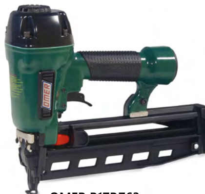
OMER B17P.763 Finish Nailer