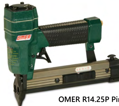
OMER R14.25P Pin Nailer

Packaging: 2500 nails per box • 16 boxes per case