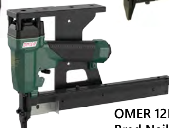
OMER 12P.25 CL4-1 Brad Nailer w/mounting bracket & remote trigger

Packaging: 2000 nails per box • 32 boxes per case