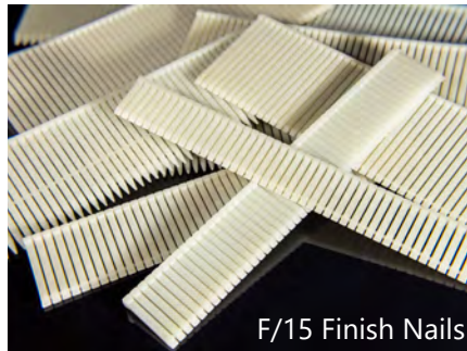
F/15 Finish Nails