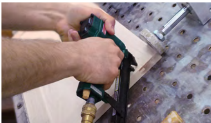
RAPTOR® nails act as a quick clamping device while glue sets