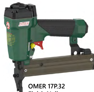
OMER 17P.32 Finish Nailer (Max length 1 1/4")

Packaging: 2350 nails per box • 16 boxes per case