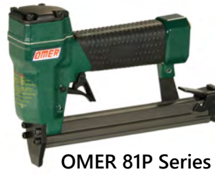
OMER 81P Series