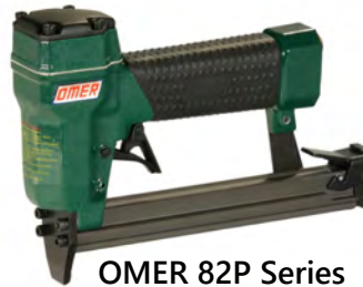
OMER 82P Series