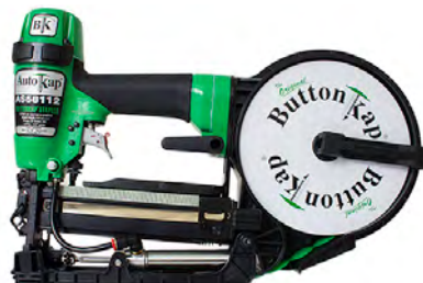
RC-SH04 Cap Stapler