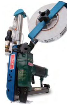
Timber Tagger w/OMER 81P Purchase at www.timbertagger.com