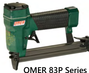
OMER 83P Series